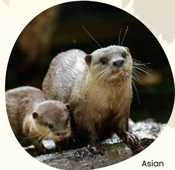
Asian small-clawed otter